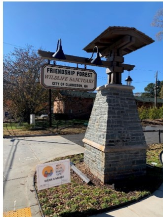
Friendship Forest---located at 4380 East Ponce de Leon Avenue, Clarkston, GA 30021, just

The City of Clarkston will celebrate the Grand Opening of the Friendship Forest Wildlife Sanctuary on March 12, 2021, at 1:00pm.