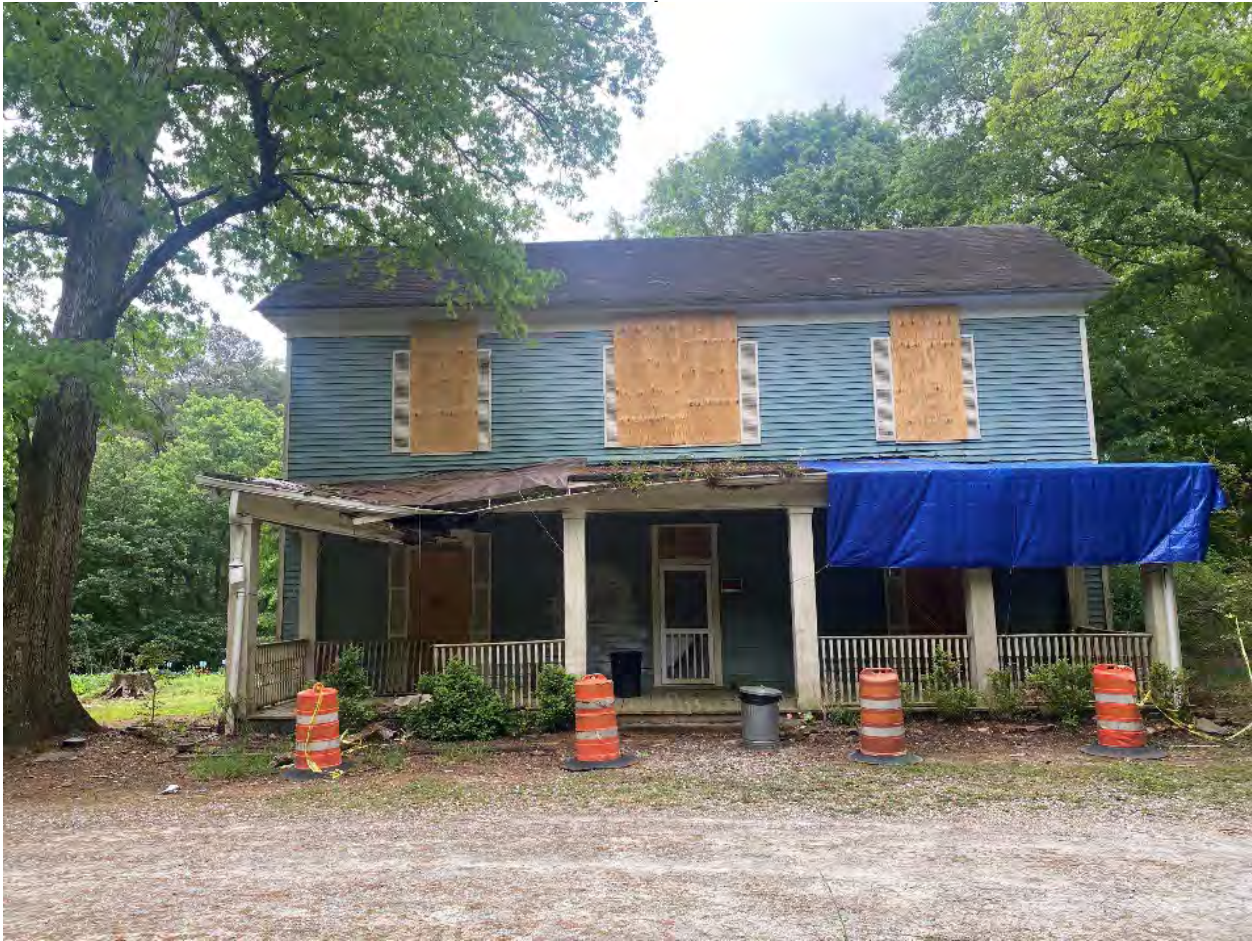
(View of North Façade, Front)