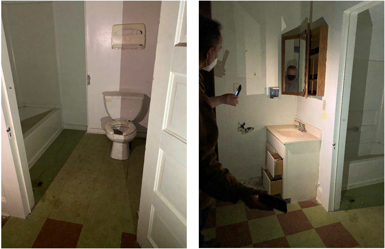
(View of Interior, Room 3 – Bathroom in the room)