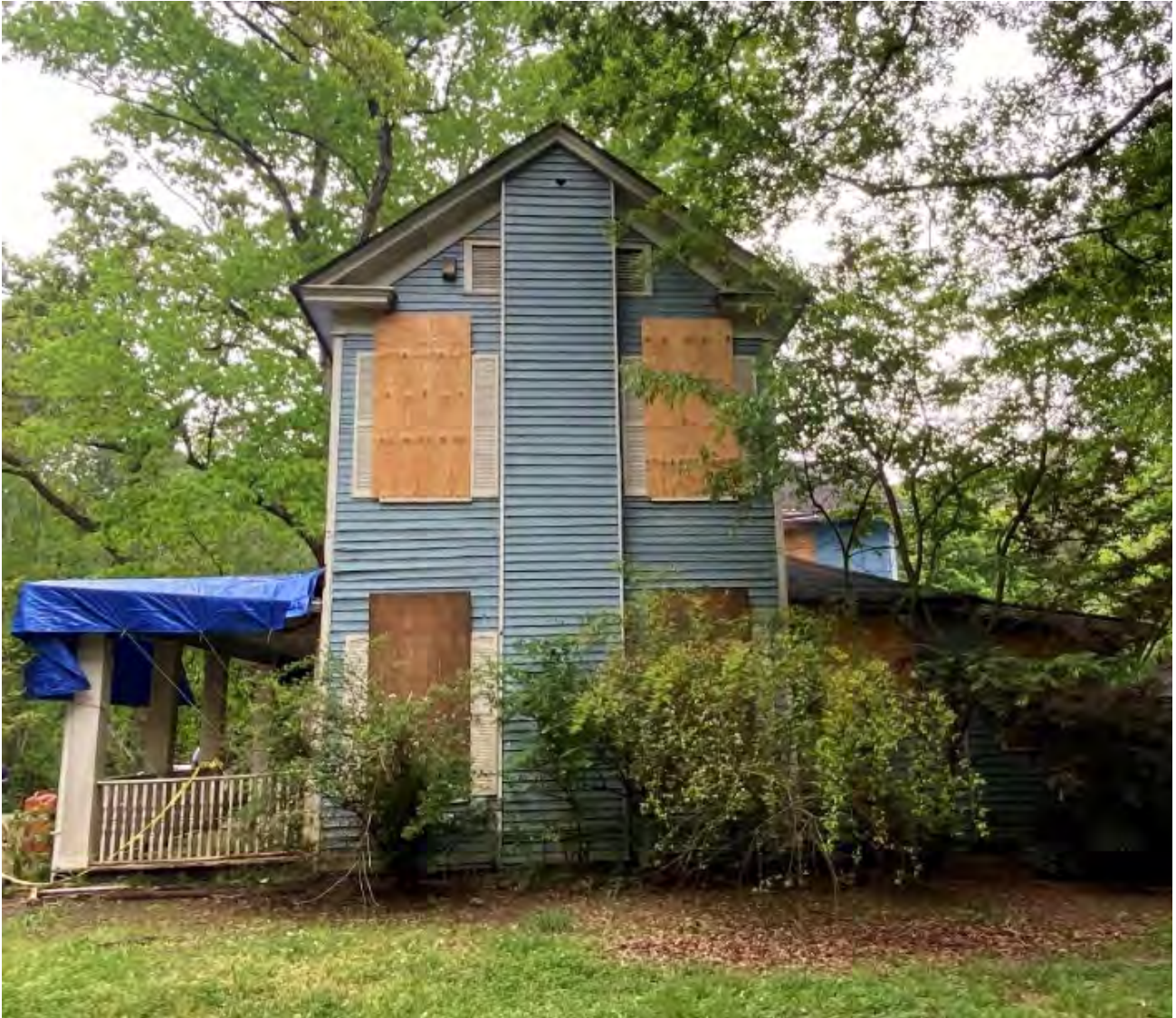
(west side view)