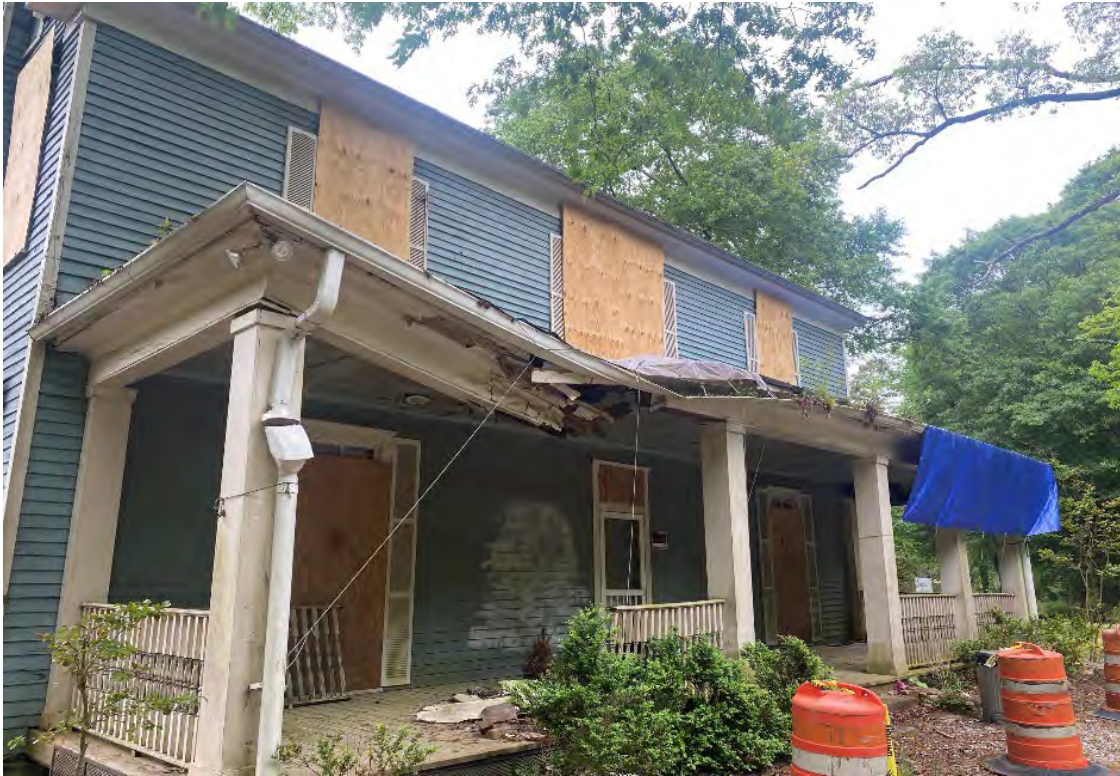
(View of North East Front Porch).