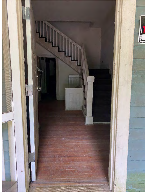
(View of Front Door, on North)