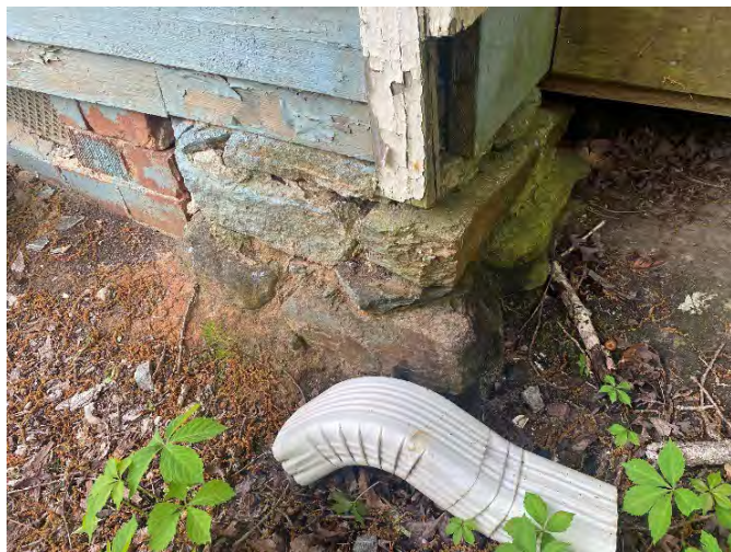
(View of North East Front Porch) / (North East Façade)