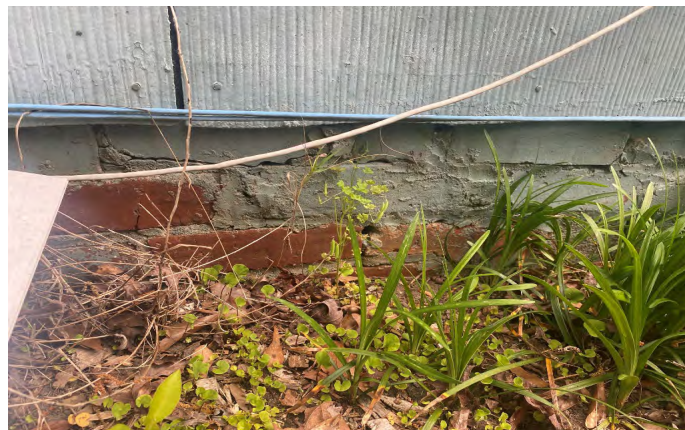
Brick Foundation rear facade