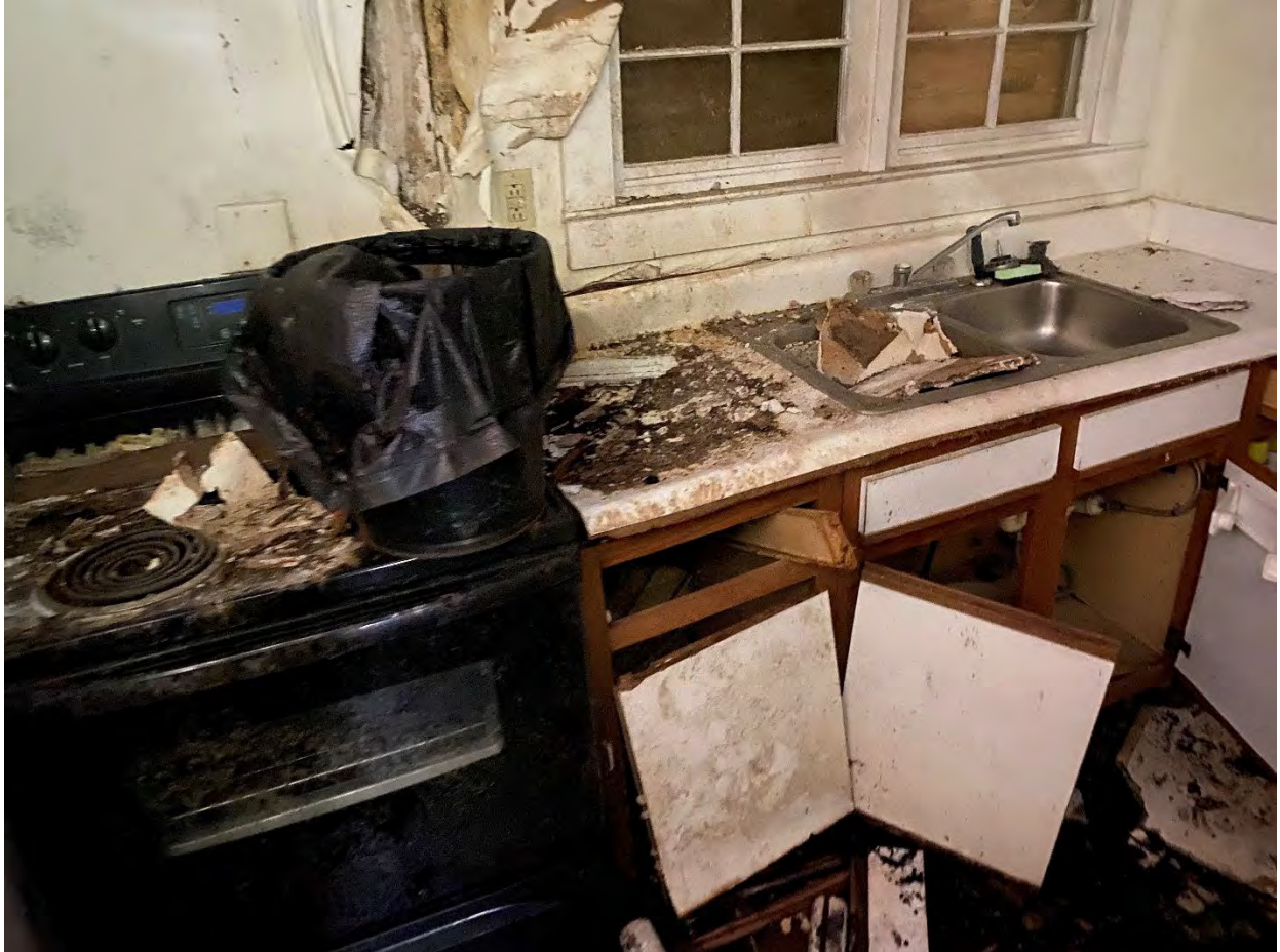
(View of Interior, Kitchen, Addition 1 & 2)