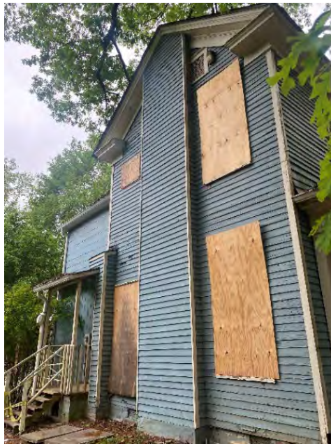
(View of East Facade)