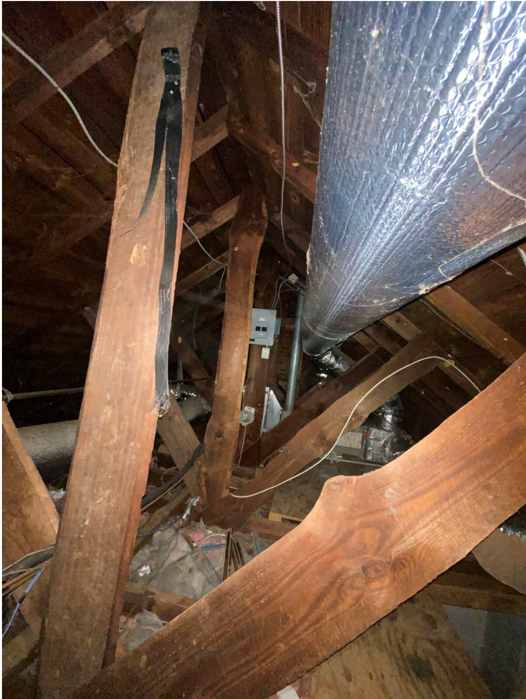
(View of Interior, attic)