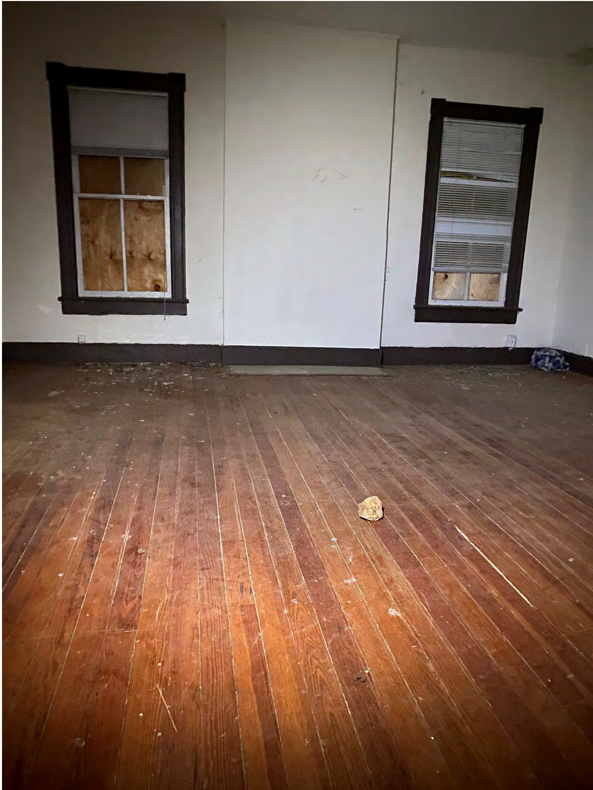
(View of Interior)