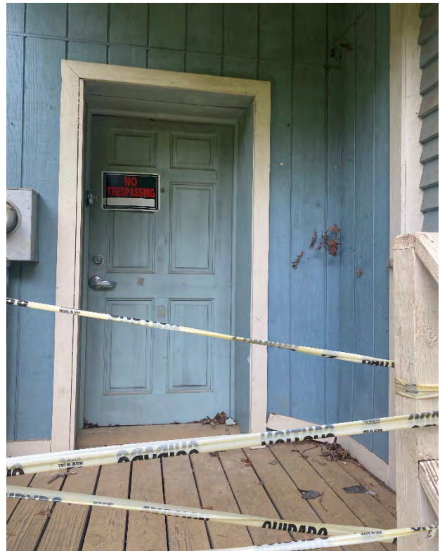
(View of East Façade, at porch and porch foundation):