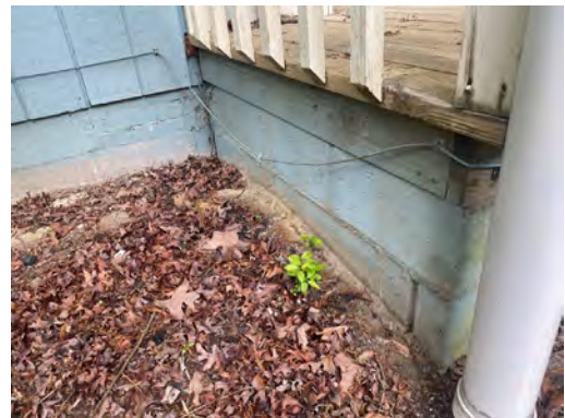
(View of East Façade, at porch and porch foundation):