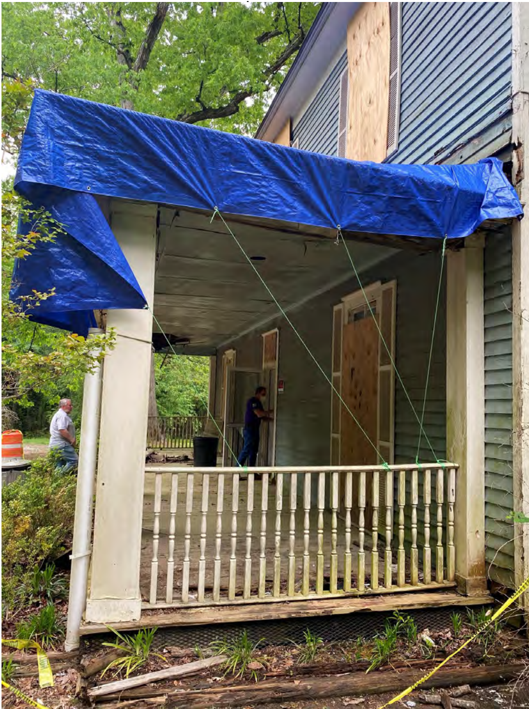
(View of North West Front Porch)