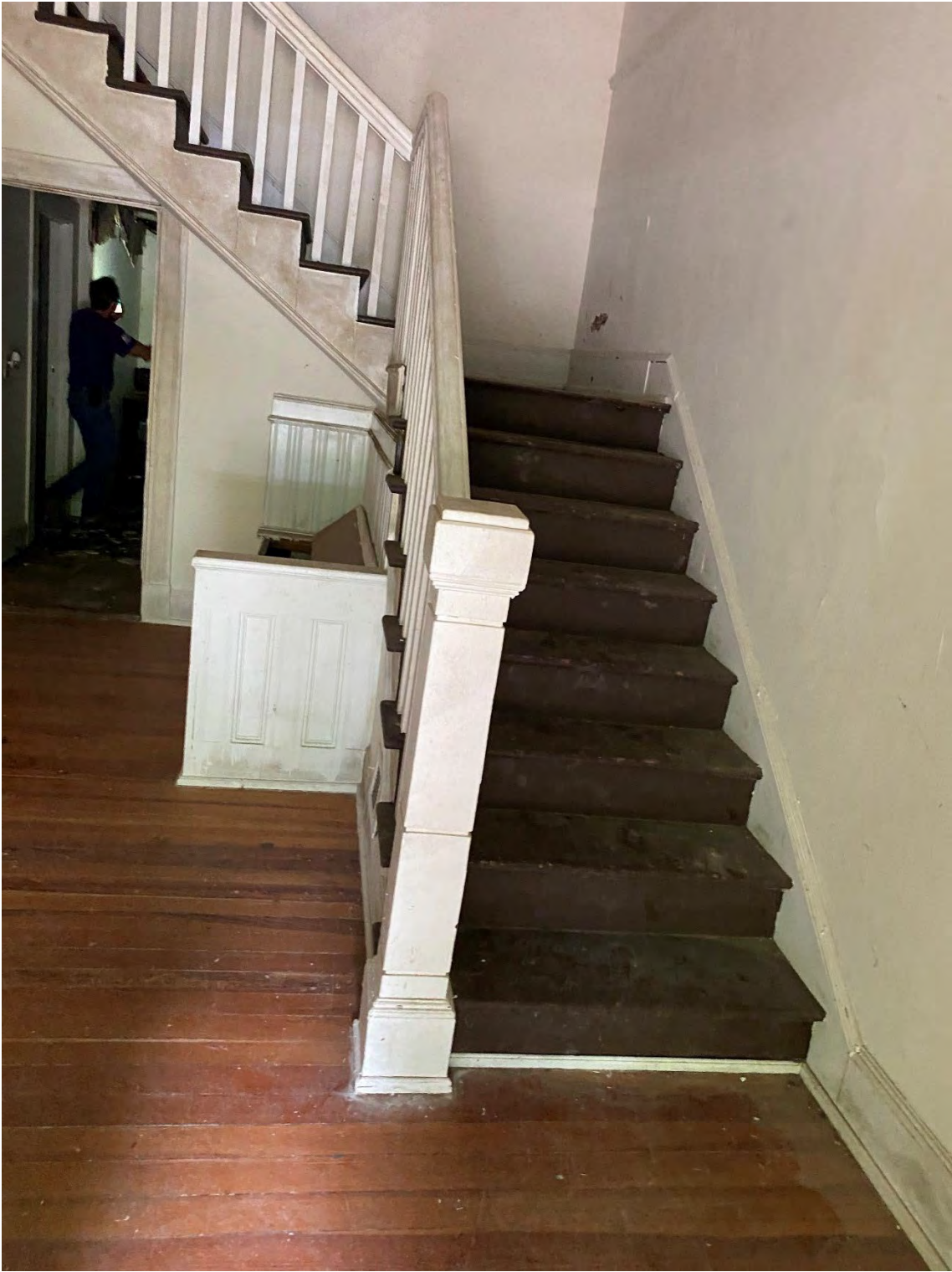
(View of Front, Interior at Foyer, at Main Structure)