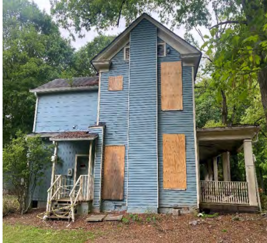
(View of East Facade)